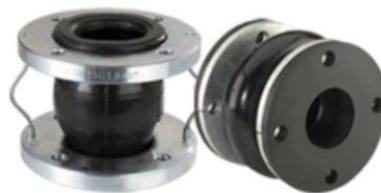
Rubber Expansion Joints >

Metraflex Company provides a multitude of flexible pipe products. In this article and in the next two weeks, I will limit the discussion to those most commonly used with hydronic pumps. I’ll also make some suggestions about