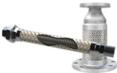
Flexible Metal Hose >