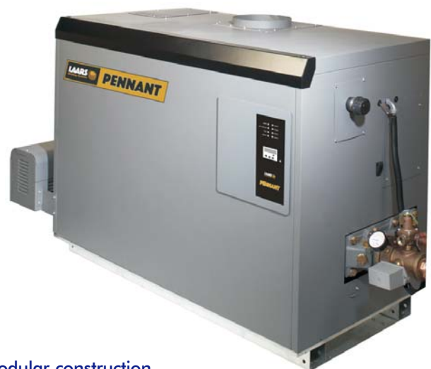
Modular construction, compliant end-walls and non-ferrous waterways

Controls are also service-friendly with clean and simple wiring and are readily accessible in a slide-out drawer. All models have a convenient front-access panel with status indicator lights to monitor power, call for heat, pump on, ignitor on, gas valve open, and lock out.