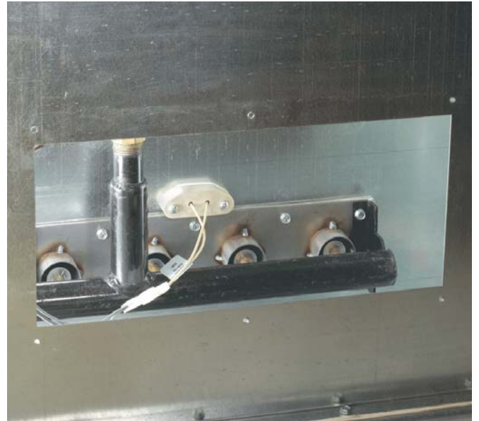
Easy access ignitor