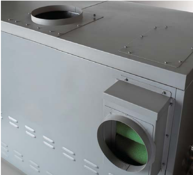
Top or rear vent and combustion air connections