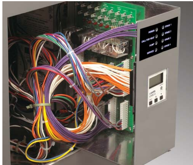
Front access panel with status indicator lights, 6 mode programmable control, and slide out tray